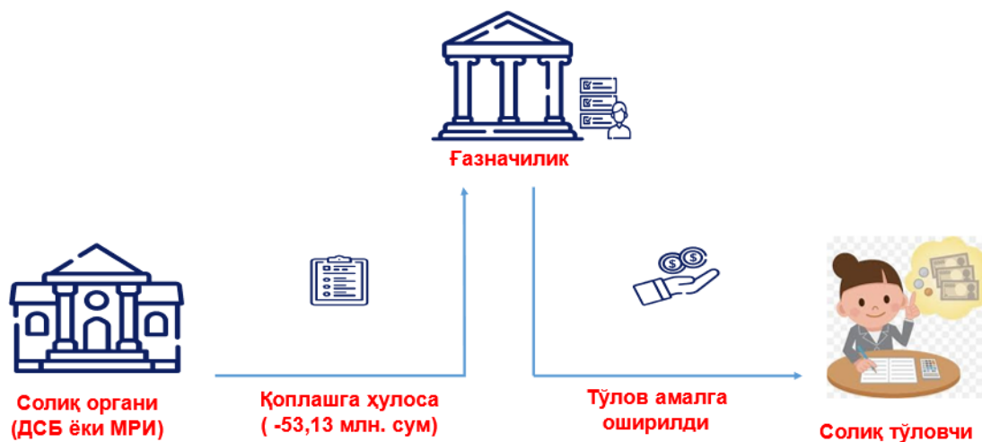
Figure 1. Value Added Tax refund process